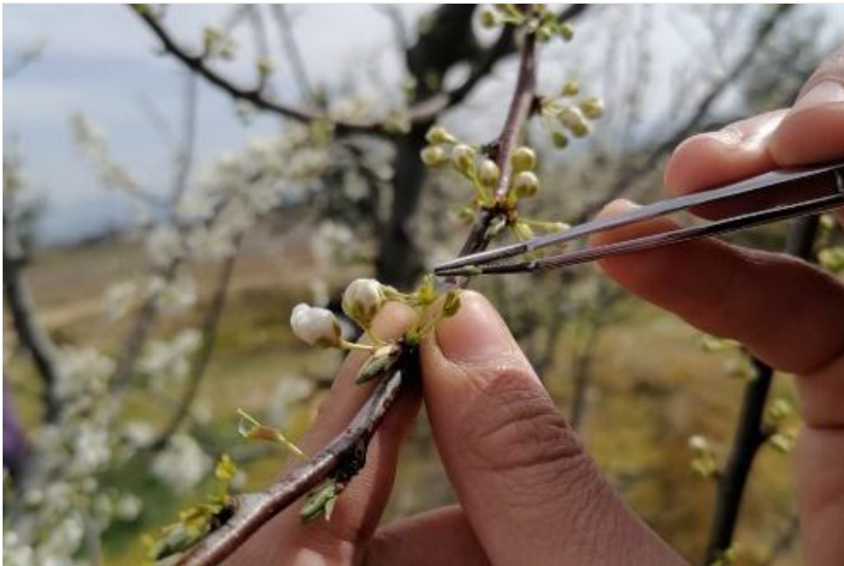
The Associated International Group of Nurseries has inducted a new member: Potamia Fruit Breeding R&D Ltd