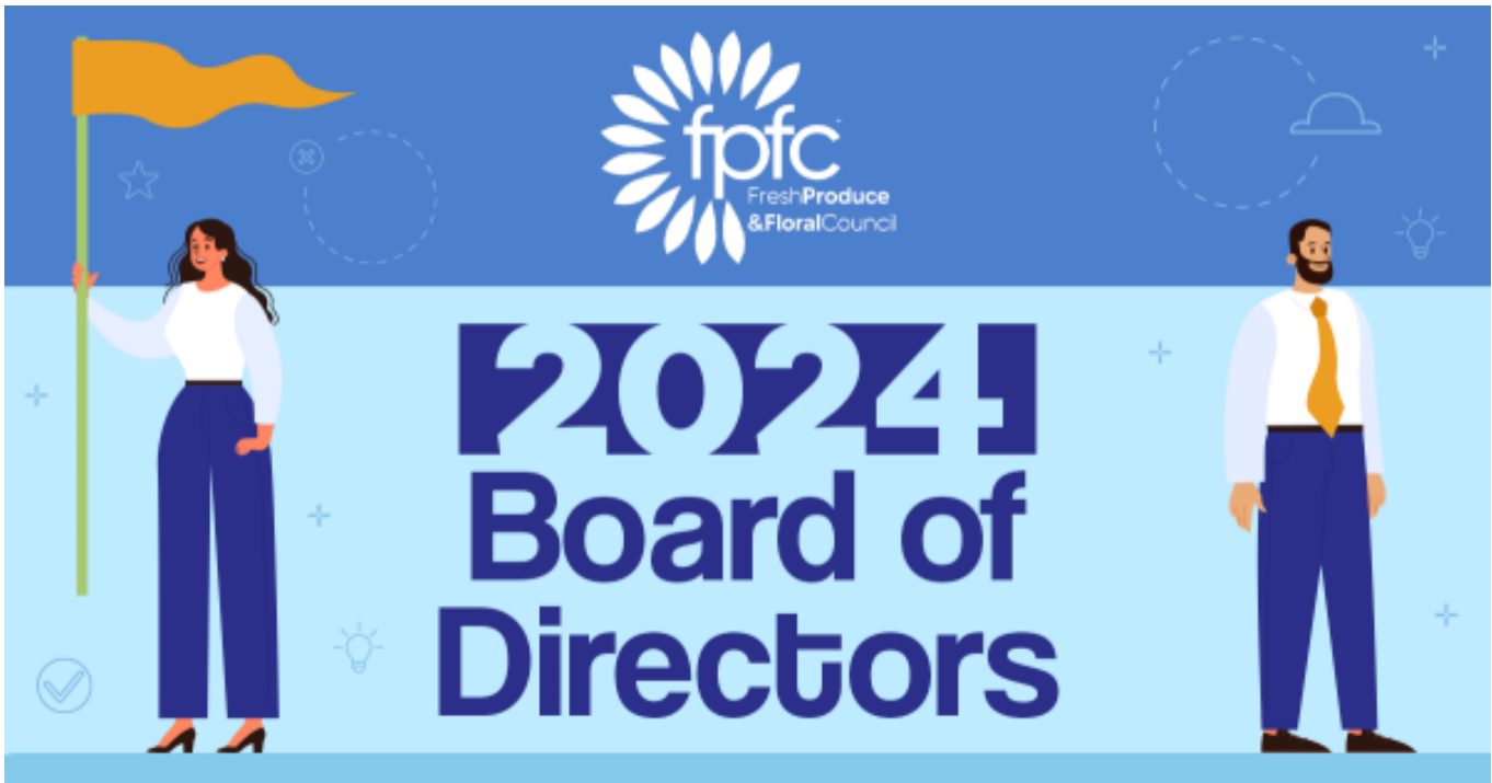
Fresh Produce & Floral Council Announces Incoming Board of...