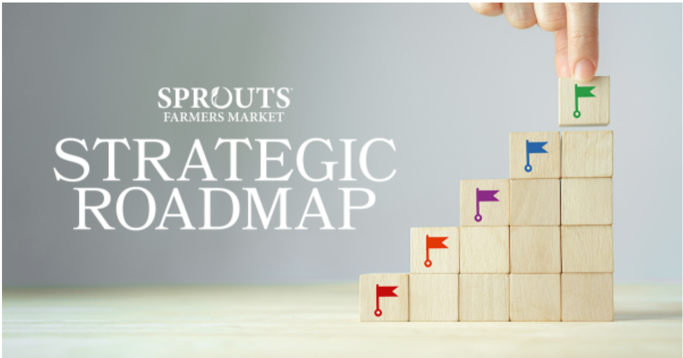
Sprouts Farmers Market Announces 2024 Strategies