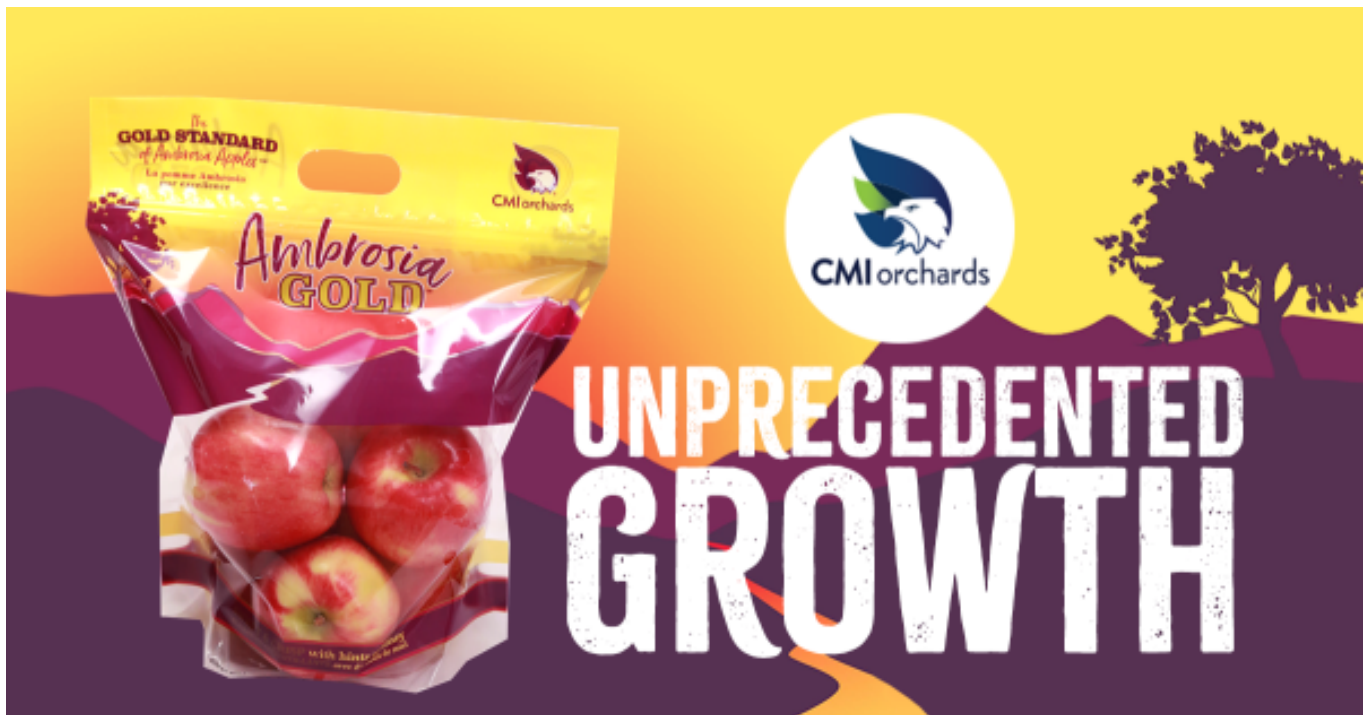
CMI Orchards Celebrates Growth in Ambrosia Gold® Apple Sales;...